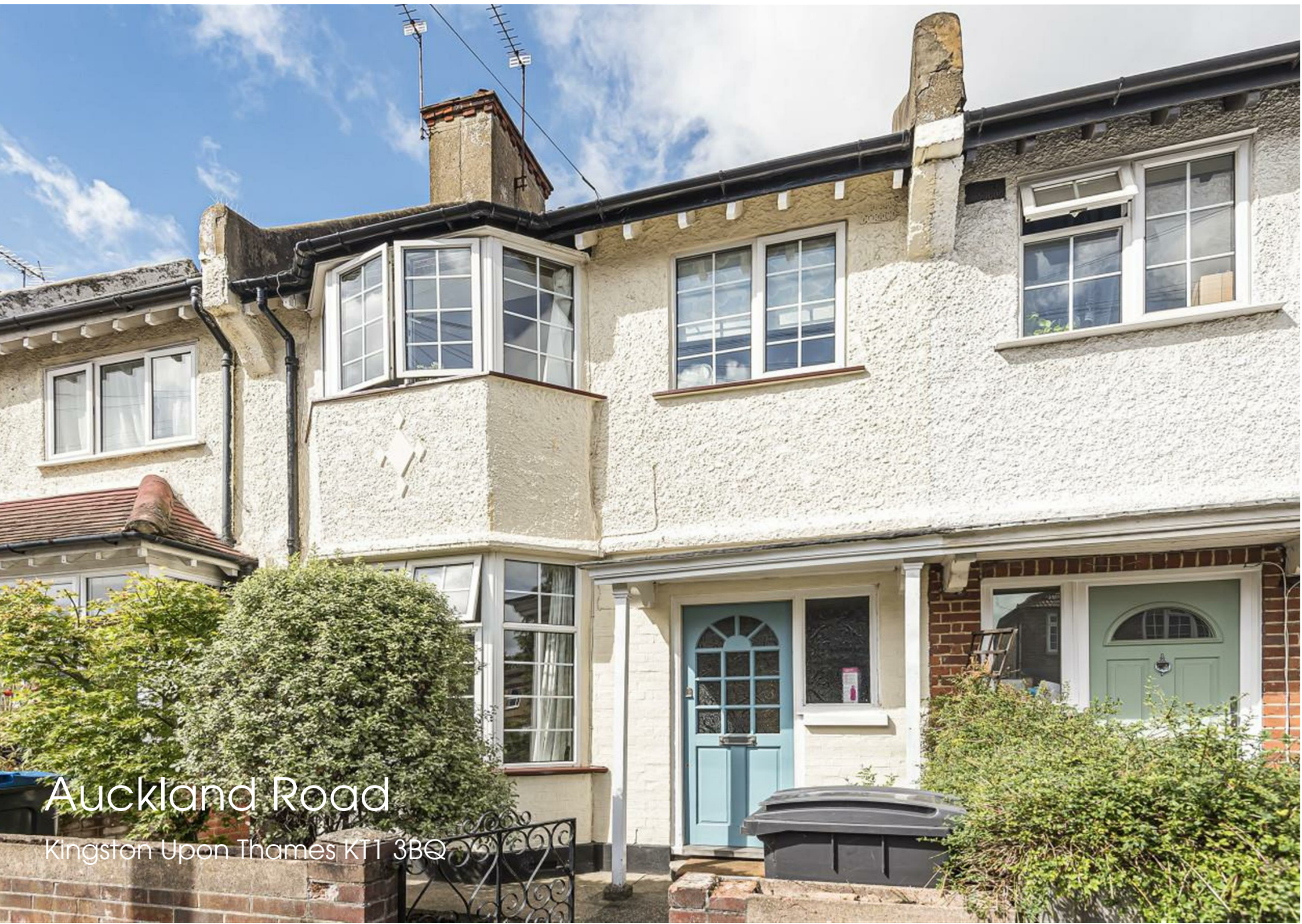
Auckland Road Kingston Upon Thames KT1 3BQ